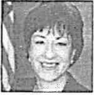
Senator Susan M. Collins

These are challenging economic times. The innovation and energy of our nation's small manufacturers are essential to meeting this challenge.