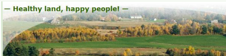
Belfast Cohousing & Ecovillage

The next Business After Hours will be hosted by Belfast Cohousing & Ecovillage on Wednesday, July 14 from 5:00 p.m. to 7:00 p.m. Save the date and watch for more information as the date grows near.