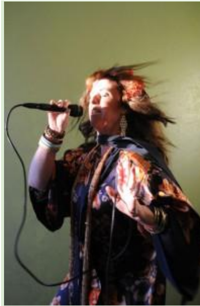
Catch the Janis Joplin Tribute This Weekend